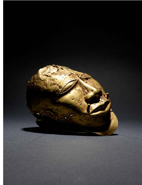
Gold Trophy Head 19 th century or earlier, Asante Kingdom