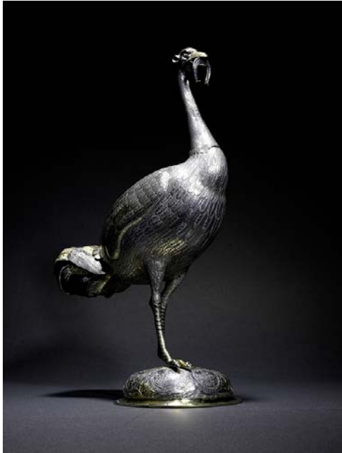
Silver Ostrich Statuette c. 1600, Augsburg, Germany