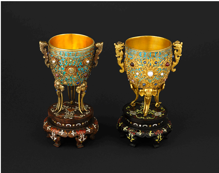
Imperial Wine Cups 18 th century, China