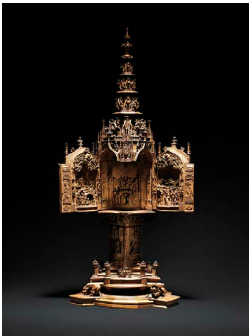
Boxwood Miniature Triptych Early 16 th century, Netherlands