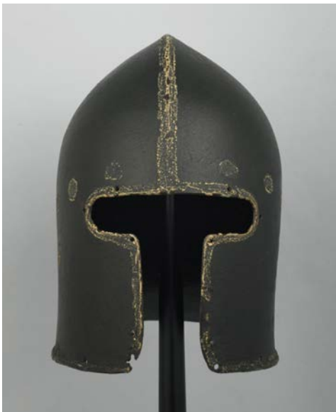
Sallet or Barbuta c. 1450, North Italian