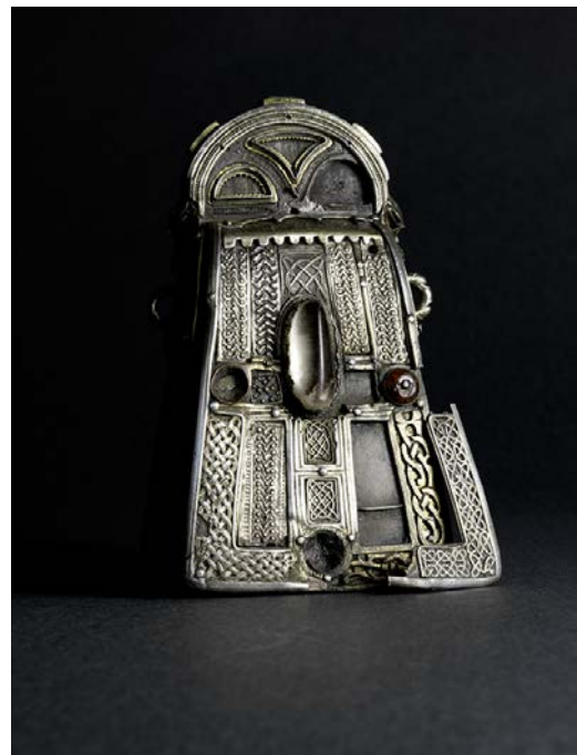
The Bell of St Mura 11th-16th centuries, Ireland