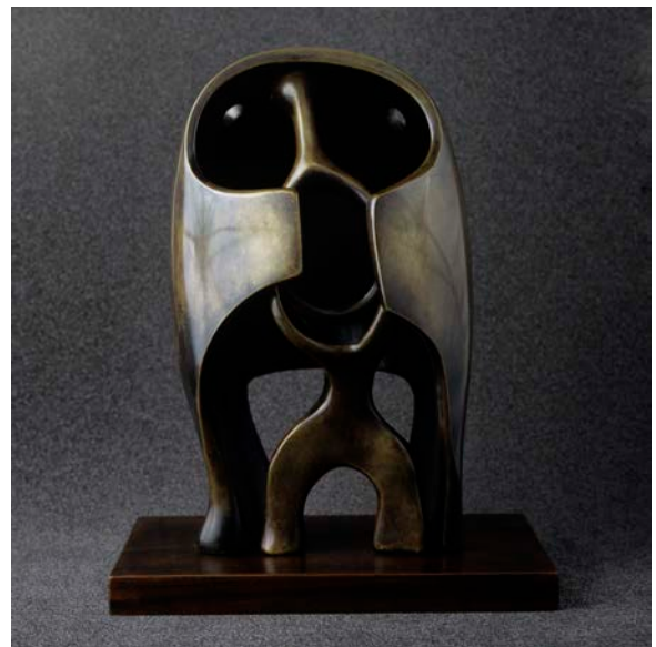
The Helmet 1939-40 bronze (LH 212)