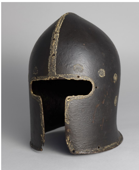
Sallet or Barbuta North Italian, c. 1450