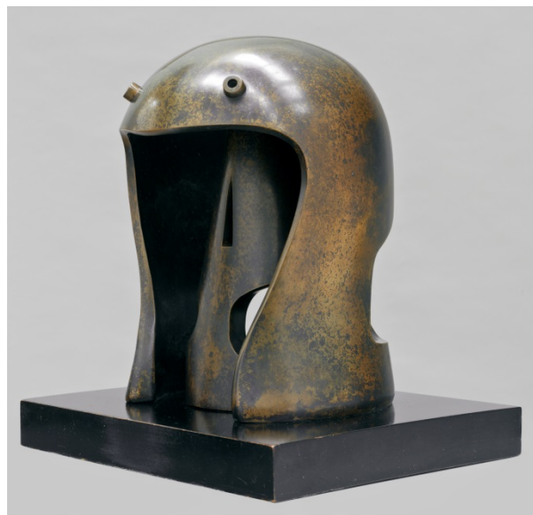
Helmet Head No. 1 1950 bronze (LH 279 cast 5). Artwork reproduced by permission of The Henry Moore Foundation