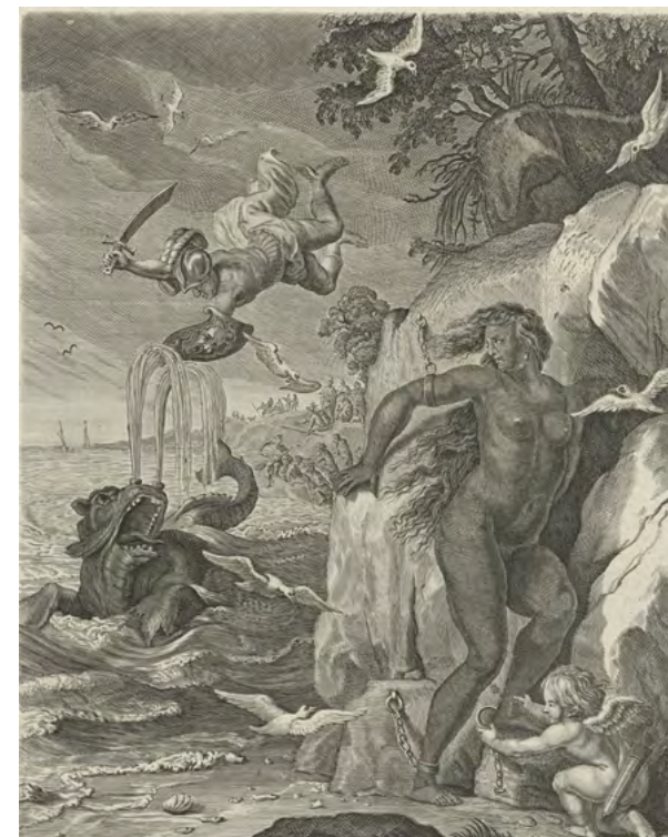
Detail from Bernard Picart (workshop of), after Bernard Picart, Perseus en Andromeda, 1731.

This text appeared in The Guardian newspaper, and is a revised and expanded version of a social media post that appeared on the Wallace Collection's platforms on 30 October 2020 as part of #WallaceConnections, a new initiative aiming to explore the often hidden narratives that connect the museum's holdings to broader social and cultural issues.