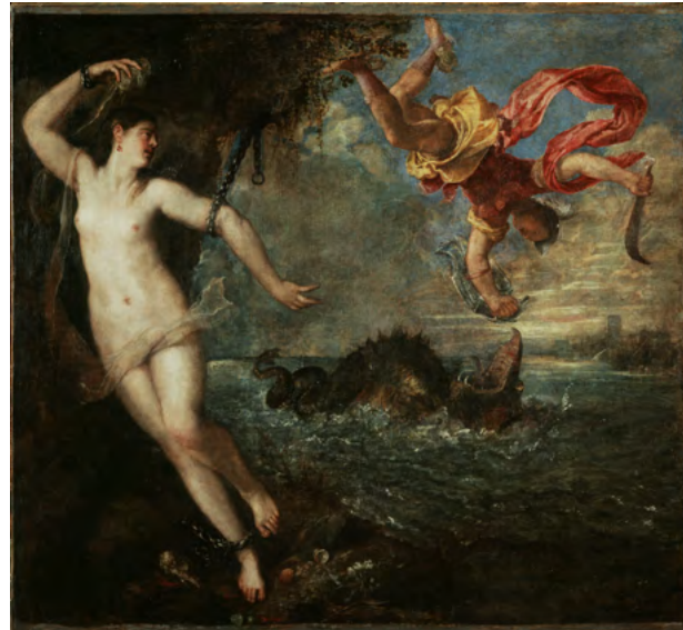
Titian, Perseus and Andromeda , 1554-56