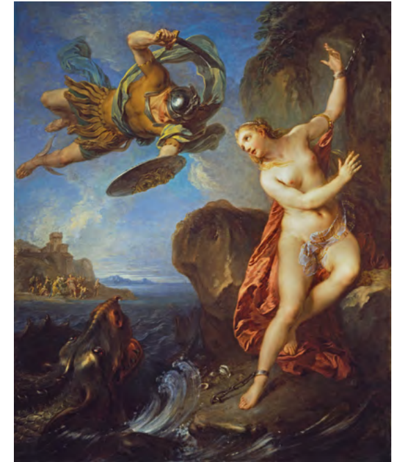
François Lemoyne, Perseus and Andromeda , 1723