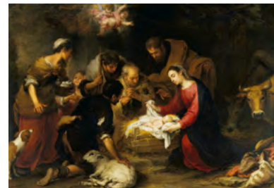
Bartolomé-Esteban Murillo The Adoration of the Shepherds c. 1665–c. 1670