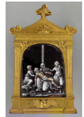
Pax, mid-16th century