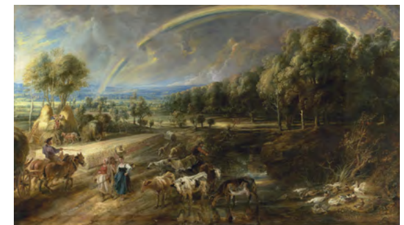
Peter Paul Rubens, The Rainbow Landscape c. 1636