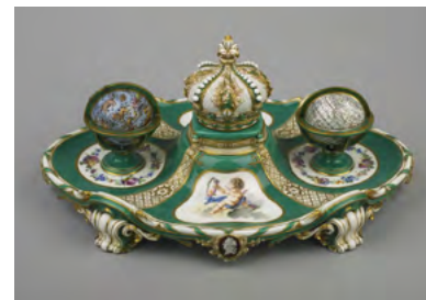
Manufacture de Sèvres Ecritoire 'à Globes' Inkstand, 1759