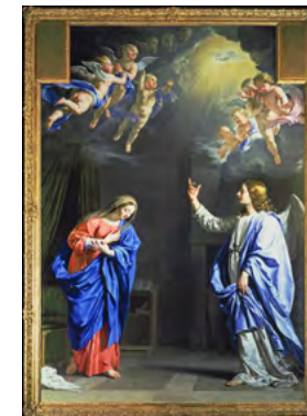
Philippe de Champaigne The Annunciation c. 1648