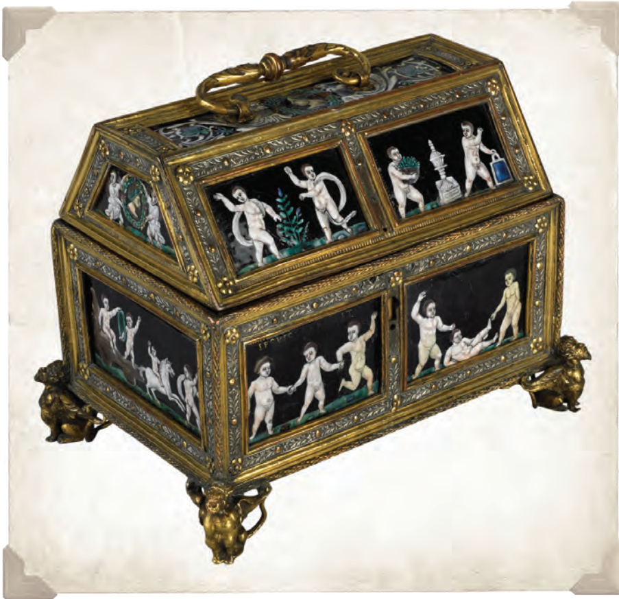
Casket, Children's Games, mid-1500s

This metal and enamel box could have been a wedding or a birth gift.