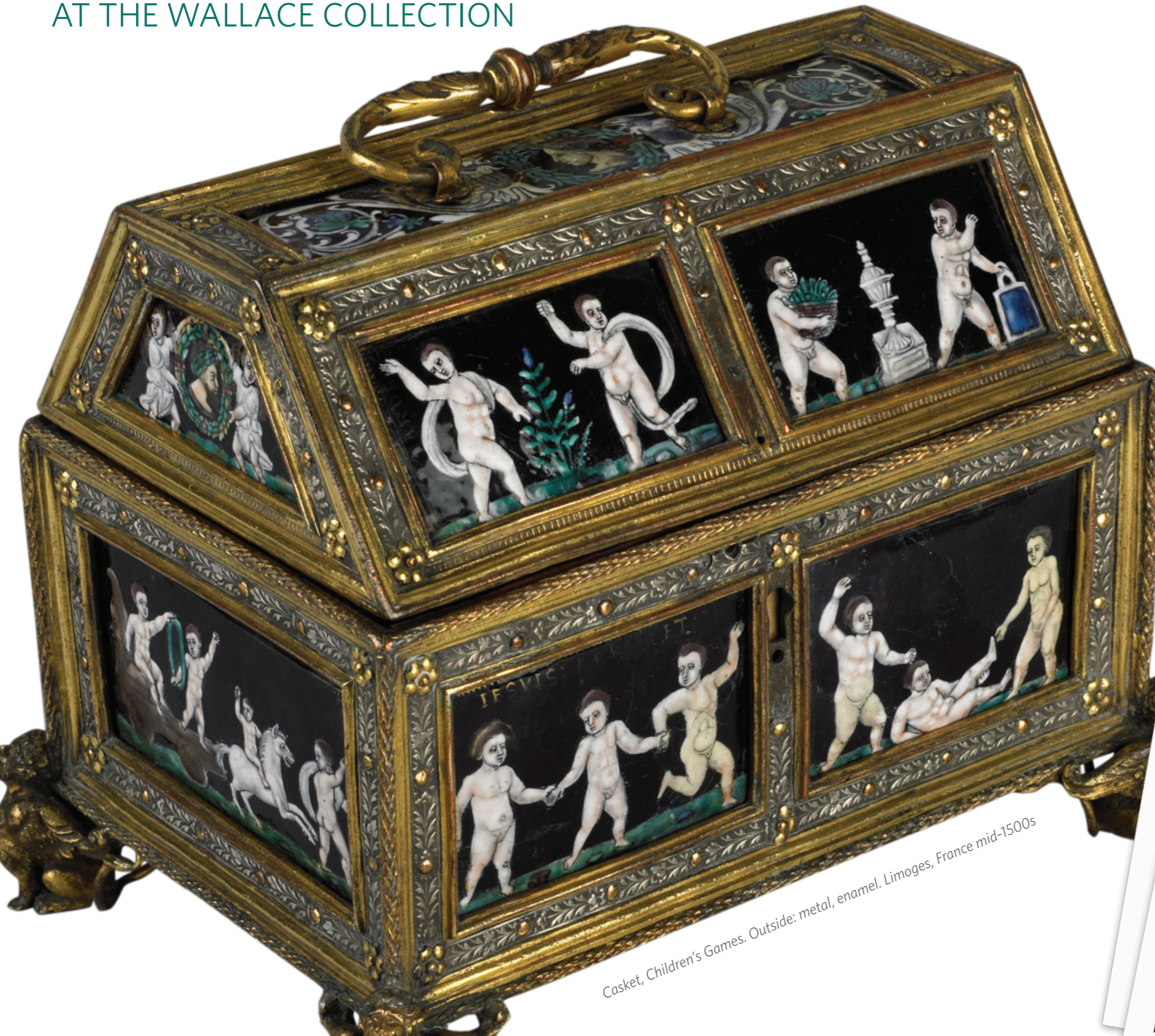
Casket, Children's Games. Outside: metal, enamel. Limoges, France mid-1500s