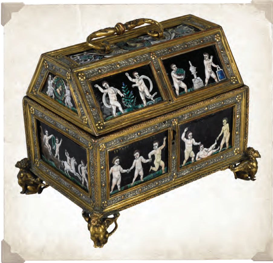
Casket, Children's Games, mid-1500s

This metal and enamel box could have been a wedding or a birth gift.