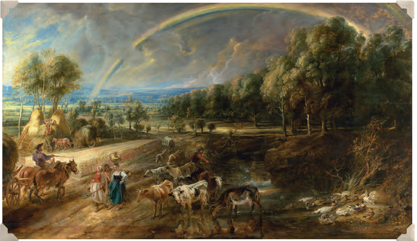
Pieter-Paul Rubens, The Rainbow Landscape , c.1636