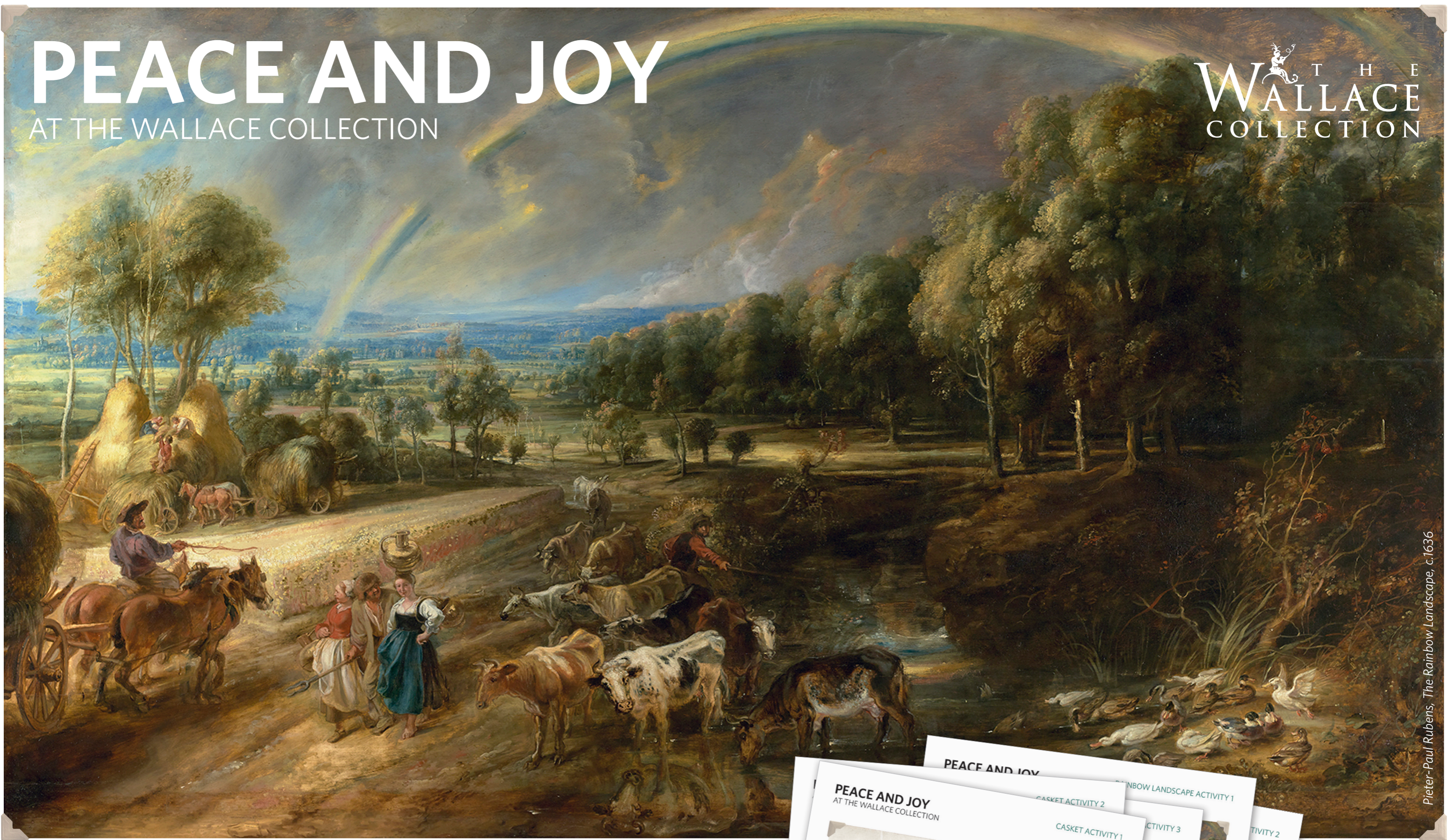
Pieter-Paul Rubens, The Rainbow Landscape, c.1636