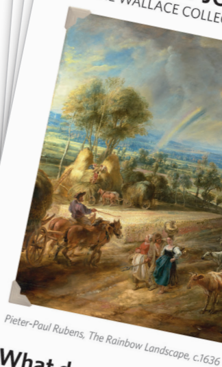
Pieter-Paul Rubens, The Rainbow Landscape, c.1636